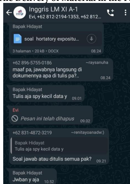
Picture. 4.3. The Delivery Material in the Form of File