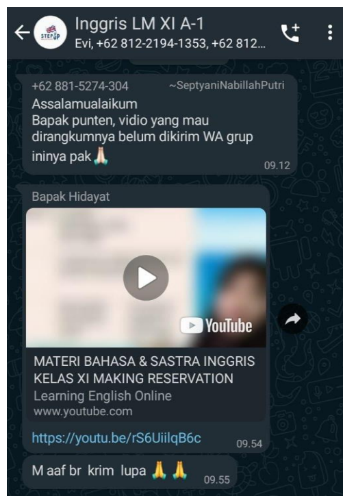
Picture. 4.2. The Delivery of Material in the Form of Video

The results of interview above are also relevant to the result of observation conducted by the researcher, as showed by the researcher as follows: