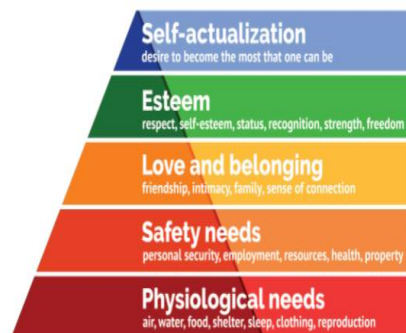
Figure 2. Maslow's Pyramid of Hierarchy of Needs (Maslow, 1943)

In the context of the stages of the CLL method, through the picture above, it can be seen that after the basic needs have been fulfilled, namely physiological needs, the need for feelings of security and comfort will arise. When the needs at the second level are met, namely the need for safety (safety needs), this is where the moment lies where learners will feel ownership and a sense of unification with the environment which is indicated by a sense of connectedness and closeness of relationship with those around them, one of which is the existence of a community or other groups. In other words, this is where the foundation lies why in this stage the CLL method considers the hierarchy of meeting the needs of learners in the learning process where the formation of a learning community will facilitate this.